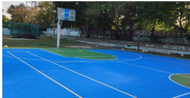
Renovated Basketball Court

A biometric attendance setup installed for teachers and school staff.